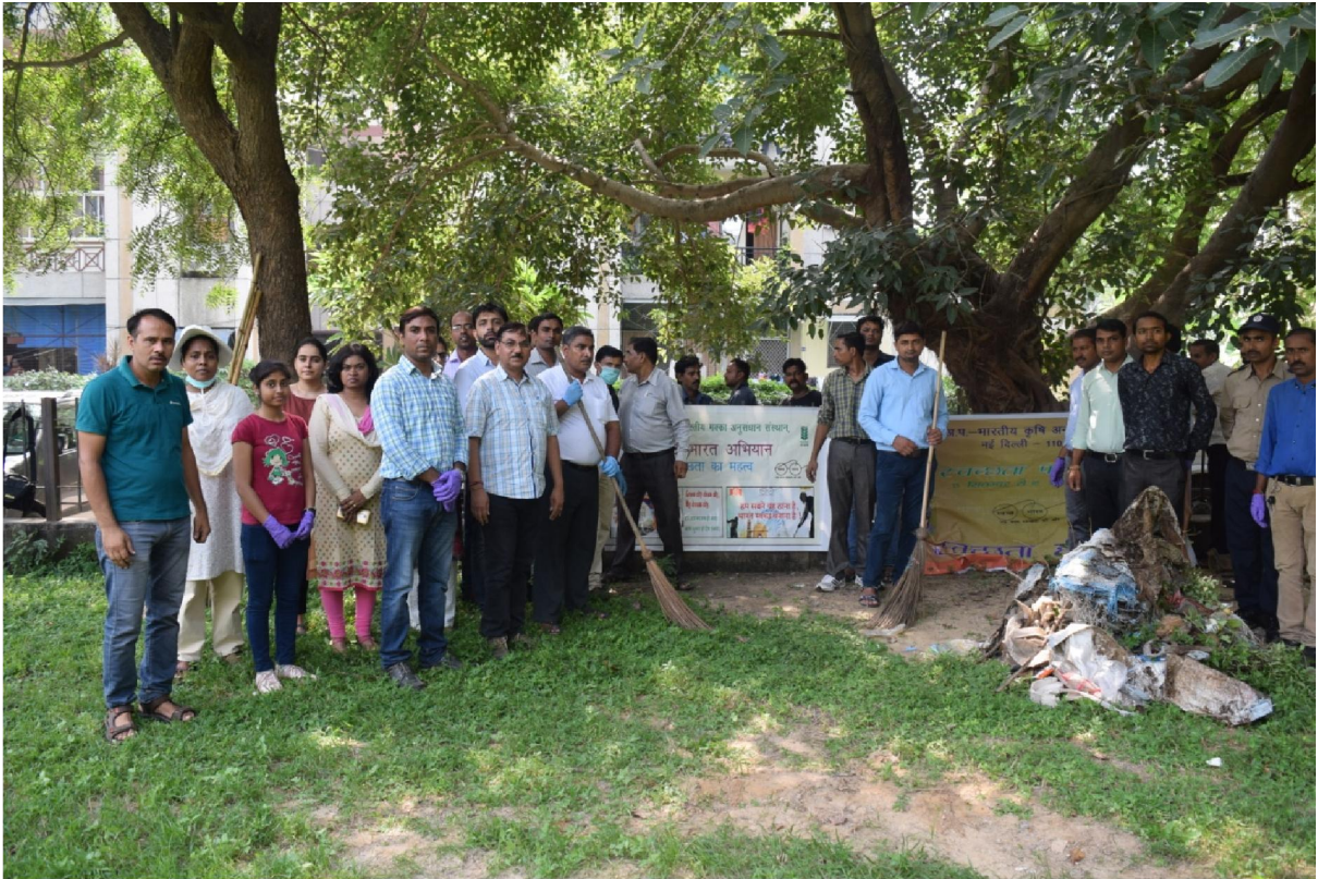
Cleanliness campaign by IIMR Delhi unit at Janak Vihar colony, Pusa Campus, New Delhi