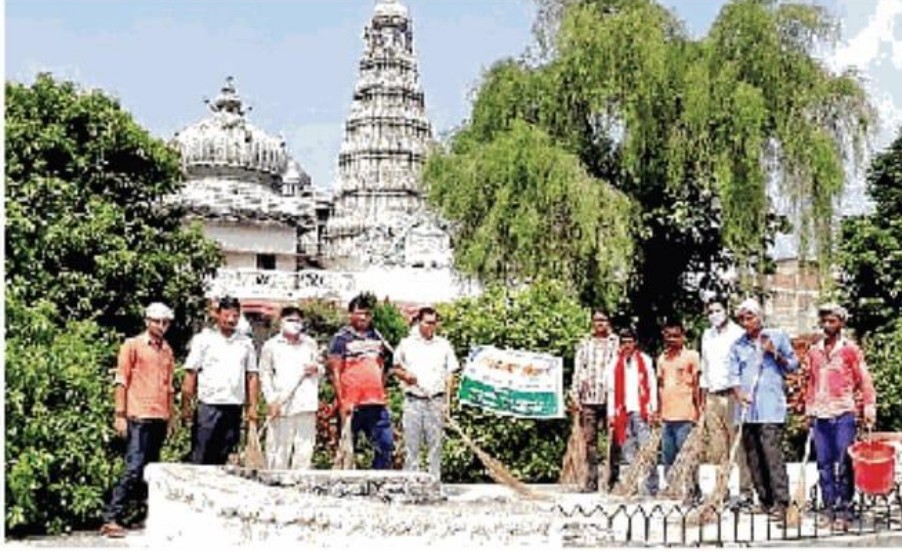
नौलखा मंदिर में स्रच्छता अभियान चलाते स्रच्छताग्रही