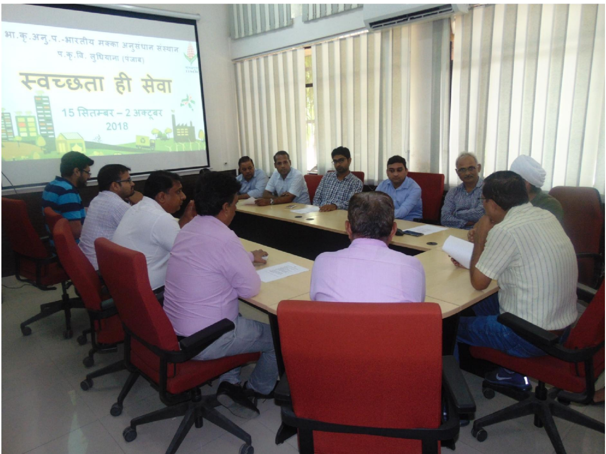
Discussion regarding Swachhata at IIMR, Ludhiana