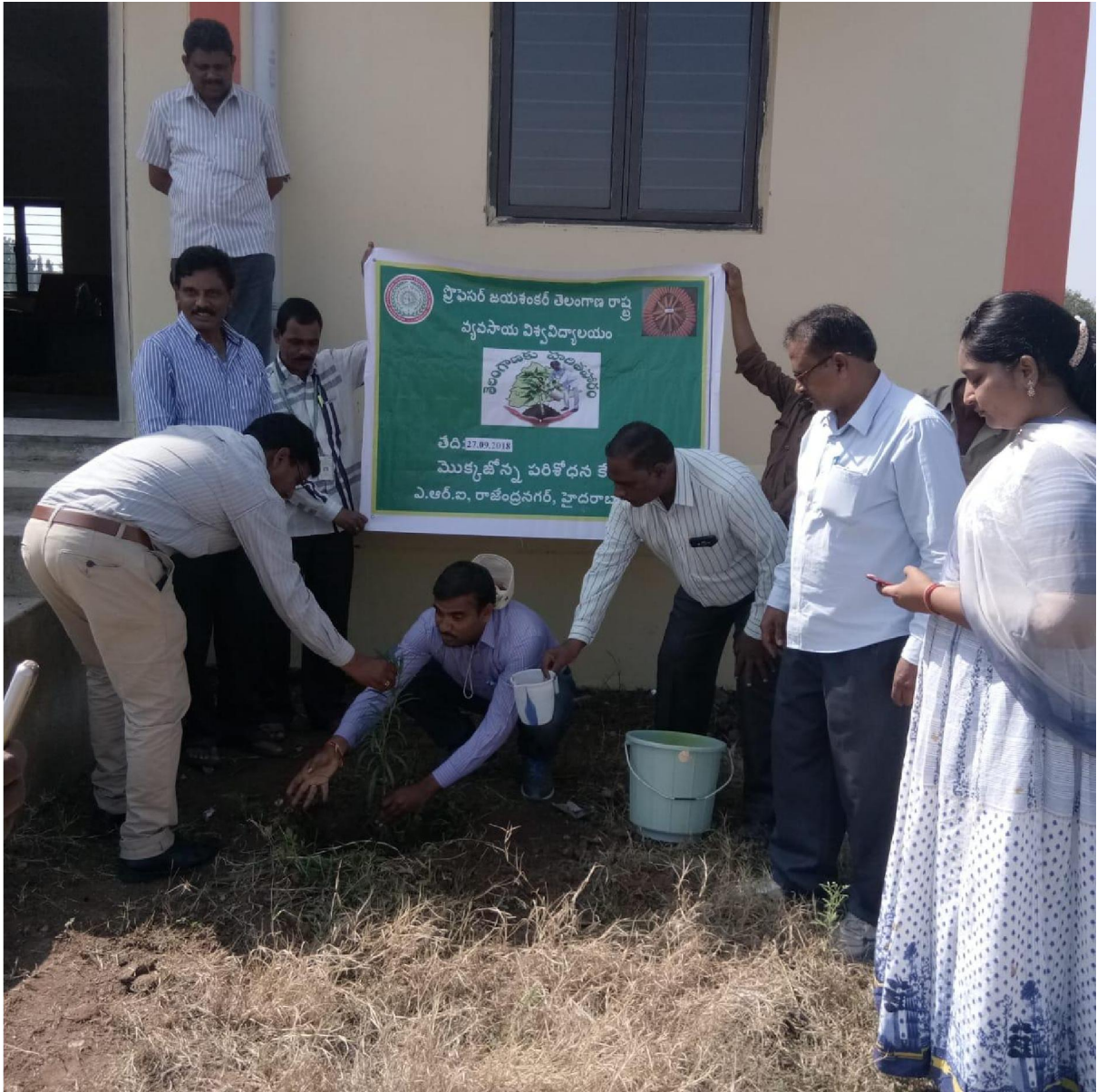
Plantation drive facilitated by WNC ICAR0-IIMR, Hyderabad