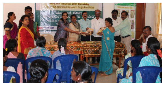
Training and input distribution at Mandya centre

The SCSP has been started by Government of India to benefit the farmers of scheduled caste (SC) communities of the country. The institute implemented SCSP plan in maize to benefit the maize growing farmers of SC community. Total 8 training programme and agricultural inputs distributions were conducted to benefit 645 famers.