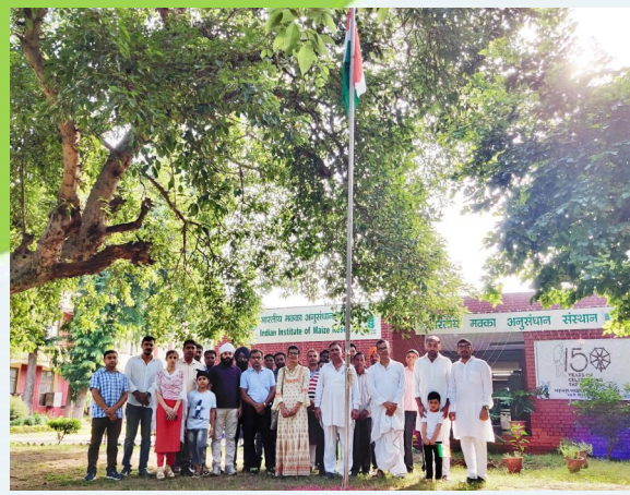
Flag hoisting on the occasion of Independence Day

The 73<sup>rd</sup> Independence Day was celebrated at all the centres of the institute with full zeal and joy. On this occasion, the Director hoisted the National Flag at Institute Headquarter. The function was attended by the staff and their family members. In his speech the Director stressed on the need of selfless service for the benefit of country.