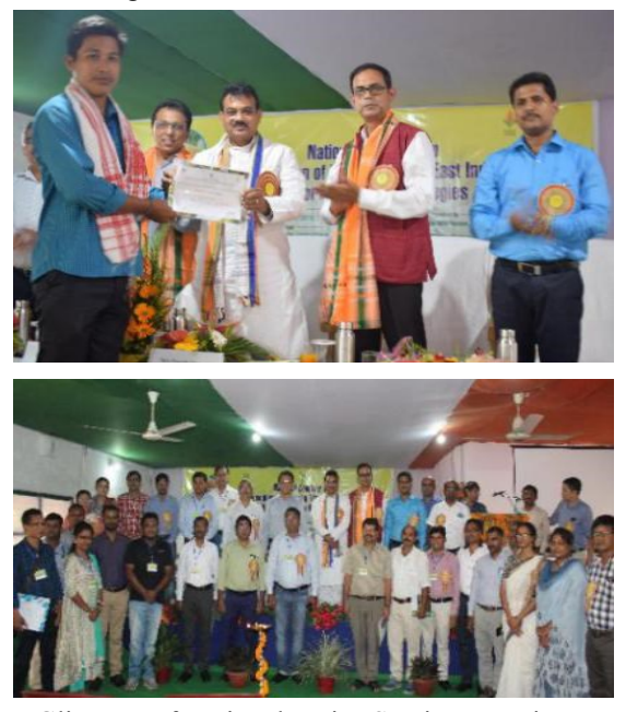
Glimpses of National Maize Seminar at Tripura

Minister of Agriculture & Farmer's Welfare & Tourism, Govt. of Tripura was present as the Chief Guest in the inaugural session of the Seminar.