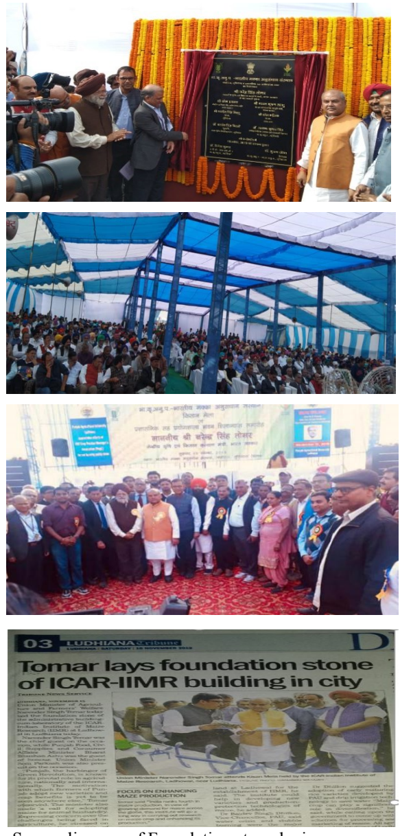
Some glimpses of Foundation stone laying ceremony of IIMR building

foundation stone of the Administrative--cum-Laboratory Building of the ICAR-IIMR at Ladhowal in Ludhiana on November 15, 2019. Shri Bharat Bhusan Ashu, Minister Food, Civil Supplies and Consumer Affairs, Government of Punjabwas the Guest of Honour. Union Minister of State for Commerce and Industry, Shri Som Prakash was Special Guest on the occasion. Shri Narendra Singh Tomar stressed on judicious use of water and adoption of crop diversification. In this regard maize can be most suitable option. On this occasion, a farmer's fair was also organized. Around 2000 farmers from various districts of Punjab visited the institute and benefited from the exhibits of the advanced scientific technologies and practices.