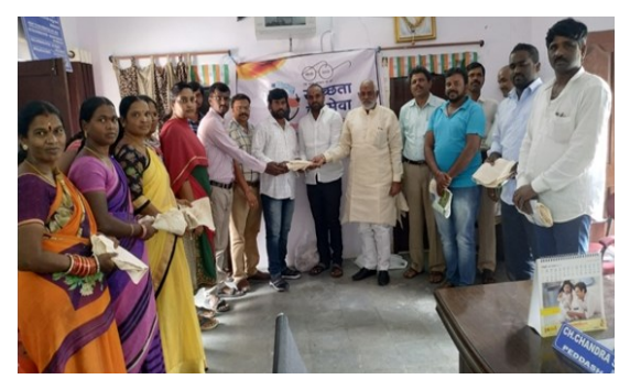
Distribution of jute bags to farmers of Peddashapur, Telangana