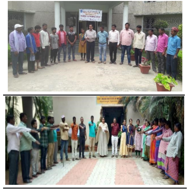
ICAR-IIMR staff undertaking the Integrity Pledge

All the staff members of ICAR-IIMR, Ludhiana and its regional stations took the pledge of integrity, transparency and accountability in their personal as well as public life on October 28, 2019 under the vigilance awareness week (October 28 - November 2, 2019). Online Integrity Pledge at individual level was also encouraged. Various events including debate, essay and quiz competitions were organized during this week.