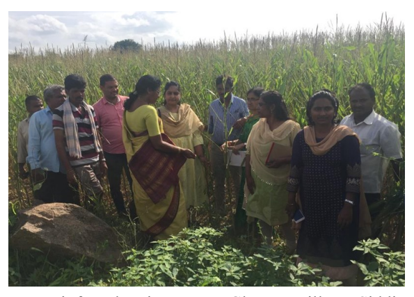
Locust infested maize crop at Ghanpur village, Siddipet district

Locust damage on maize was reported from Govardhana Giri village in Thoguta mandal on September 11, 2019.Scientists from Winter Nursery Centre (WNC), Professor Jayashankar TelanganaState Agricultural University (PJTSAU) and officials from the State Department of Agriculture, Telangana conducted a diagnostic survey in Siddipet district, Telangana for assessing the locust damage in maize crop. Suitable recommendations were made for the management of Locust.