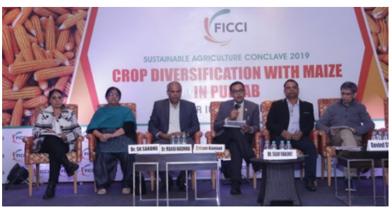
Director, ICAR-IIMR expressing his views during Sustainable Agriculture Conclave