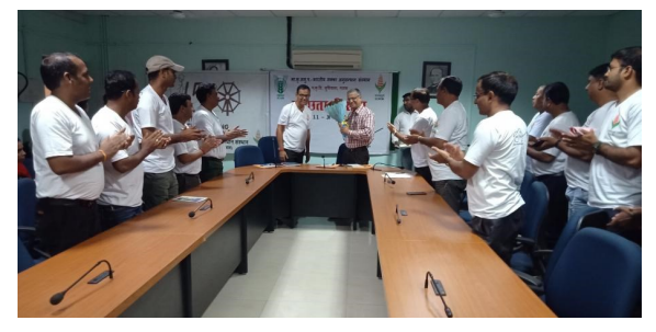
Chief Guest facilitated by the Director ICAR-IIMR

On the occasion of Gandhi Jayanti, essay and painting competitions were organized for school students at ICAR-IIMR Ludhiana. The theme of the competitions was "India of Gandhi Ji's dreams". The Swachhta Hi Sewa campaign which was initiated from September 11, 2019 was also concluded on this occasion. Best performing students were awarded on the occasion.