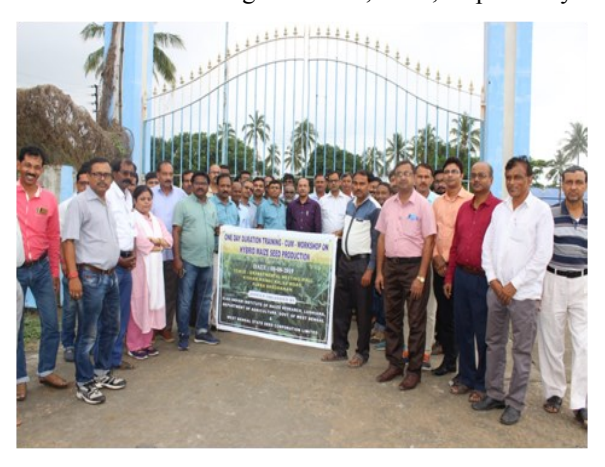
Participants of the training program

ICAR-IIMR, Ludhiana jointly with the Department of Agriculture, Govt. of West Bengal and West Bengal State Seed Corporation Ltd. (WBSSCL), Kolkataconducted two trainings onhybrid maize seed production in West Bengal at Jalpaiguri and Purba Bardhaman districts onAugust6 and 8, 2019, respectively.