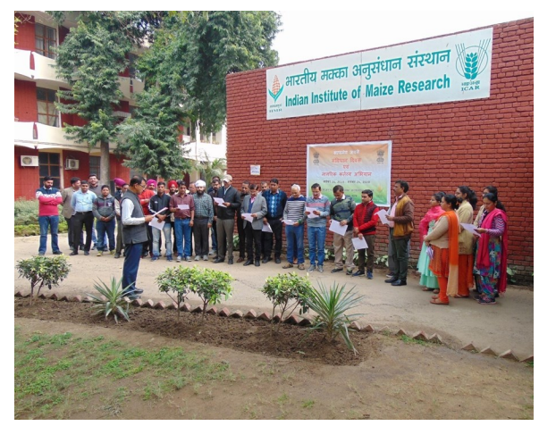
ICAR-IIMR staff taking pledge on the Constitution Day

Constitution day was observed at ICAR-IIMR and its regional stations on November 26, 2019. On this occasion all staff members took pledge by reading the preamble of the Constitution. Director, ICAR-IIMR apprised the staff about the duties of the citizens and stressed upon the staff to place the country supreme in all the individual endeavours.