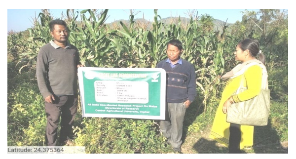
FLD during kharif 2019

The frontline demonstration (FLDs) were conducted on 375.2 acres in 12 states benefiting 598 farmers during kharif 2019. The yield under FLDs varied from 18.0 to 74.2 q/ha in various agro-ecologies which were higher than the farmer practice (FP) yield ranging from 14.7 to 64.2 q/ha. The yield gains of FLDs were 3.9% and 127.7% higherin the states of Punjaband Manipur, respectivelyover existing farmers practice. The demonstration of drought tolerant hybrid at Hyderabad and Karimnagar gave yield advantage of22%. The quality protein maize (QPM) demonstrations at Barapani (Meghalaya) gave yield advantage of 26%.