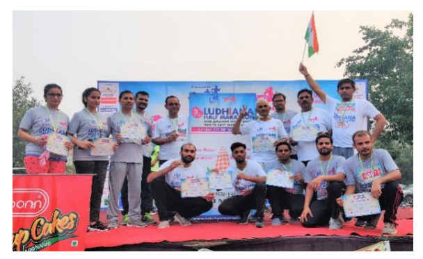
ICAR-IIMR staff during Half Marathon