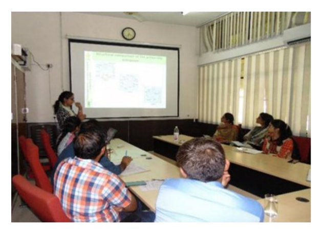
Some glimpses of institute seminar at ICAR-IIMR, Ludhiana