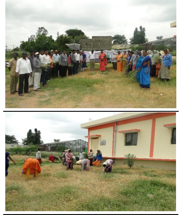
ICAR-IIMR staff uprooting Parthenium from fields

Parthenium Awareness Week was observed at the institute headquarters and its regional stations during August 16-22, 2019. All the scientists and staff members were involved in the removal of Parthenium from the fields and from nearby areas. Farmers were also made aware about the harmful effects of Parthenium and need of its timely removal before its flowering to reduce next generation load.