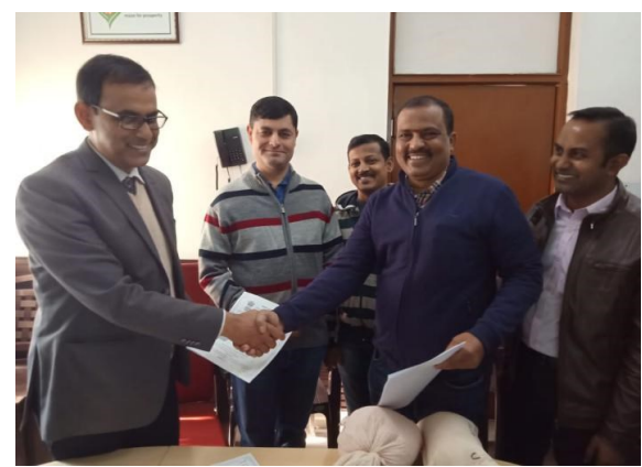
Director, ICAR-IIMR signing MoU with M/s Sampoorna Seeds Pvt. Ltd.

For enhancing the adoption of institute technologies, a MoU was signed between ICAR-IIMR and M/s Sampoorna Seeds Private Limited, Hyderabad at IC-AR-IIMR, Ludhiana on December 5, 2019 for the hybrid seed production of the maize hybrid DMRH1305.