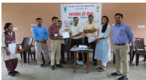
Glimpses of various activities undertaken during the Swachhta Hi Sewa campaigns