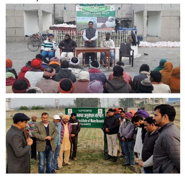
ICAR-IIMR scientist interacting with the farmers

Farmers' day was celebrated at ICAR-IIMR and its regional stations on December 23, 2019. On this occasion, apart from discussion on issues related to farming, the farmers were also sensitized about environmental issues. They were encouraged to avoid the use of Single Use Plastics in their daily life as well as during farm operations. Discussion was also held on the scientific methods of cultivation and control of the insect pests and diseases of maize.