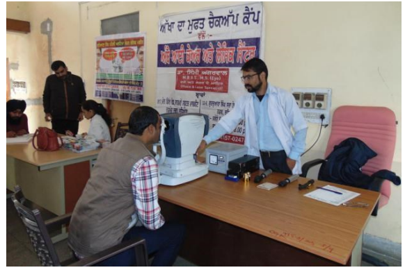
Free eye check-up camp at ICAR-IIMR