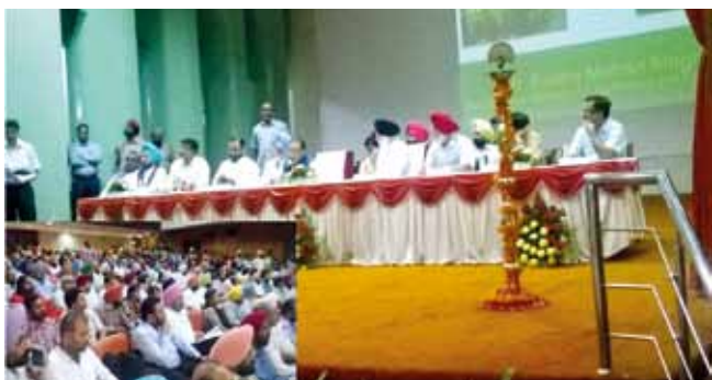
Union Agriculture Minister interacting with farmers at PAU, Ludhiana inset- farmers attended meeting