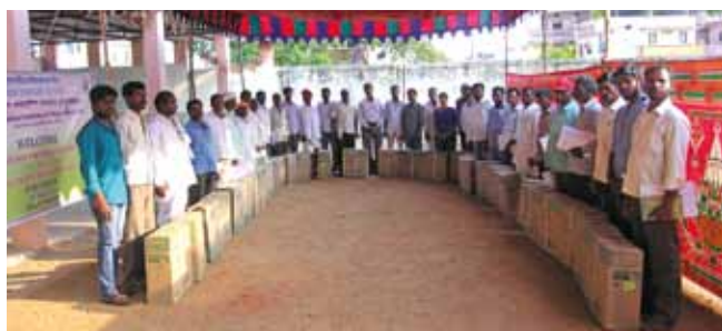
Distribution of sprayers to tribal farmers of Ranga Reddy district, Telangana