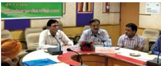
ADG (FFC) addressing the trainee