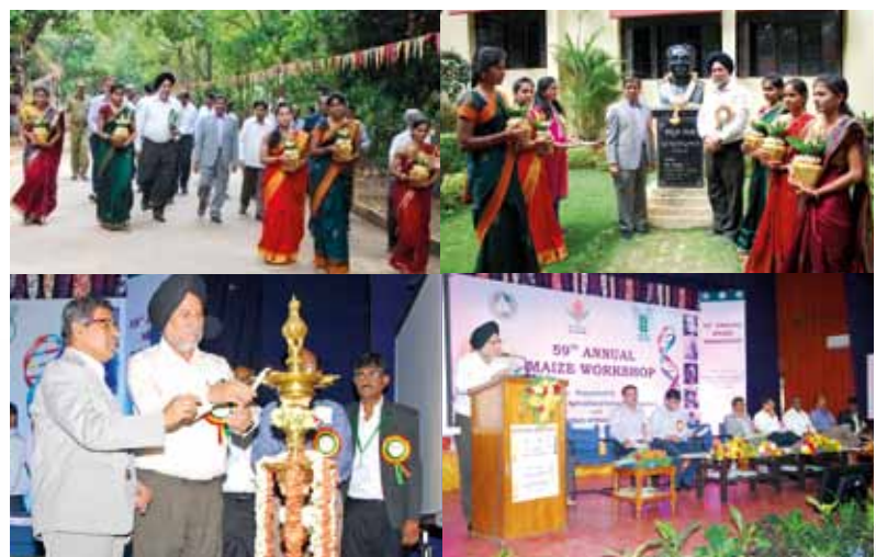
Glimpses of Annual Maize Workshop