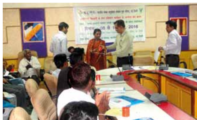
TSP programme at IIMR

Extension services are being provided through Front Line Demonstrations (FLDs), field days, trainings etc., under National Food Security Mission (NFSM) and Tribal Sub-Plan (TSP) scheme. During Rabi 2015-16, a total of 10 ha at Basireddypalli village, Ranga Reddy district, Telangana were covered under FLDs. During the year 2016-17, IIMR has been allotted 300 FLDs, out of these 200 demonstrations have been allotted to different AICRIP centres and NGOs to demonstrate technologies in various states during kharif 2016. Government of India's TSP scheme was implemented to upscale the knowledge and uplift the economic conditions of tribal farmers. The Institute organized three National Level Training programmes from 16-18 February, 8-10 March and 14-16 March, 2016 at New Delhi for tribal farmers in respect of latest production systems and value addition technologies of maize. In these trainings, 105 tribal farmers from 6 states viz. Chhattisgarh, Gujarat, Jharkhand, Jammu and Kashmir, Odisha and Rajasthan were trained. The seed of improved maize hybrid and maize shellers were also provided to each farmer.