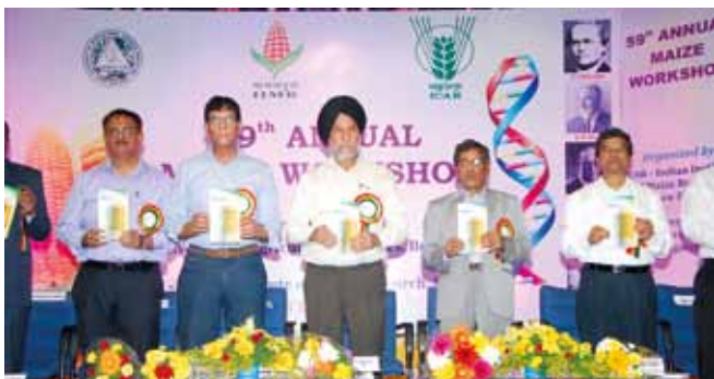
Release of "Maize Journey with IIMR"