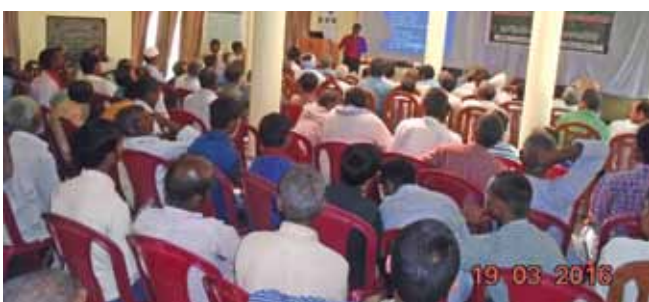
Farmers Training at Begusarai

The trainings on scientific cultivation of maize for enhanced profitability, hybrid maize seed production and agricultural skill development were organized at Regional Maize Research & Seed Production Centre, ICAR-IIMR, Begusarai for farmers of Bihar state.