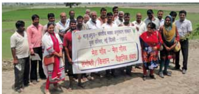
Kisan Gosthis in Jakhouli (Haryana)

Under "Mera Gaon, Mera Gaurav" scheme of Government of India, IIMR selected villages in 5 states viz., Andhra Pradesh, Haryana, Punjab, Rajasthan and Bihar. Winter Nursery Centre, IIMR in collaboration with MRC, PJTSAU, Hyderabad adopted 5 villages viz., Burjugadda Thanda, Shamshabad Mandal, Ranga Reddy District, Pamulaparathi, Wargal Mandal, Medak District, Polepalli, Jadcherla Mandal, Mahbubnagar District, Batlachandaram and Dadapur, Doma Mandal, Ranga Reddy District in Telangana. Under this scheme two Gosthis in Jakhouli (Haryana) and Pamulaparthi, Hyderabad (Telangana) were organized where more than 90 farmers participated. The farmers meet were organized and the objective and purpose of selection of villages under Mera Gaon Mera Gaurav has been discussed. Crop advisories were given and created awareness about technical and other related aspects such as farming, soil health management and water conservation. Distributed Rotary weeders and shellers to 30 tribal farmers of Burjugadda Thanda village under TSP. Inputs such as maize seed was distributed to farmers of Pamulaparathi village under FLDS based on cluster approach and Polepalli, Batlachandaram and Dadapur villages under TSP. In Rajasthan soil health card have been prepared and distributed in the selected villages.