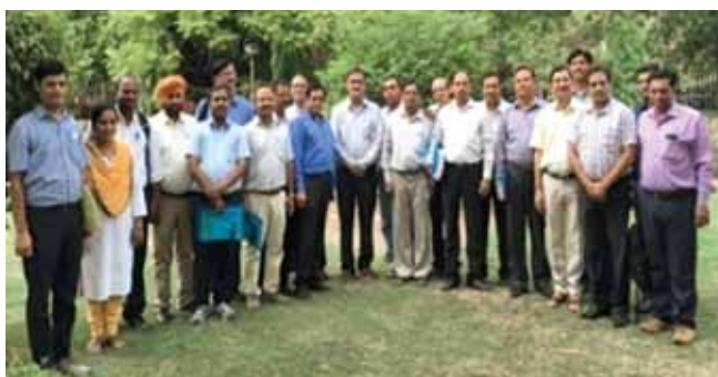
Group photo with Trainee