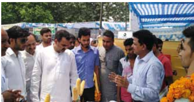
Farmers Field school at Muzaffarnagar

IIMR also participated in "Gramoday Se Bharat Uday" programme at Jamshedpur, Ranchi (Jharkhand) on 23-24 April, 2016. More than 100 visitors and dignitaries visited the IIMR exhibition and discussed various issues on maize based production systems. Hon'able Prime Minister of India Shri Narendra Modi was addressed the programme on occasion of National Panchayati Raj day on 24th April, 2016 in J.R.D Tata sports complex Jamshedpur.