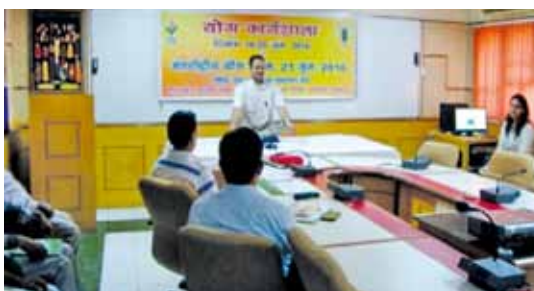
International Yoga Day celebration