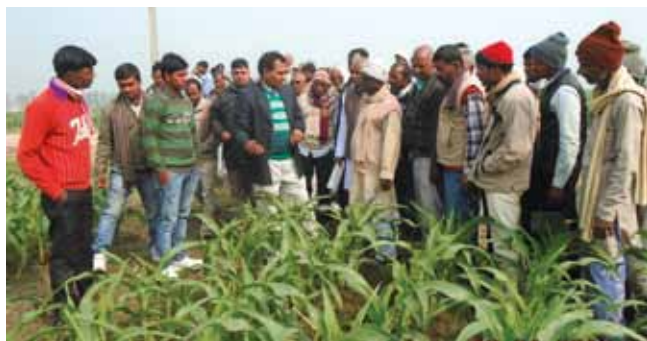
Farmers visit at Begusarai

In Bihar, seed of three varieties of soybean were distributed to the farmers. Fifteen Technologies leaflets/bulletins covering the maize technologies were also provided to the farmers. The general issues like Pradhan Mantri Fasal Bima Yojana, Soil Health Cards, and Marketing Systems were also the part of discussion during interaction with farmers. The associated agencies with "Mera Gaon, Mera Gaurav" scheme were International Plant Nutrient Institute, Begusarai, DATTC Ranga Reddy district, PJTSAU, Rajendranagar, Sri Sathya Sai Village Integrated programme and Department of Agriculture, Sonapat, Haryana.