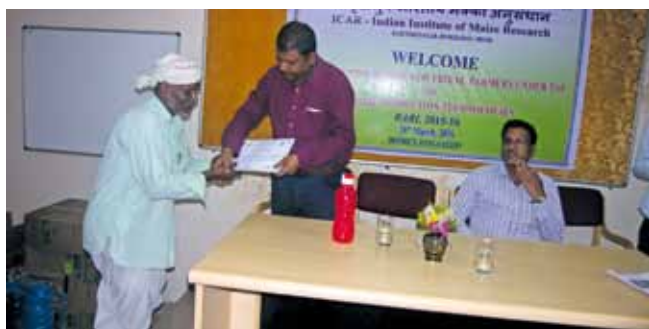
Distribution of certificates to tribal farmers of Burjugadda Thanda, Ranga Reddy district