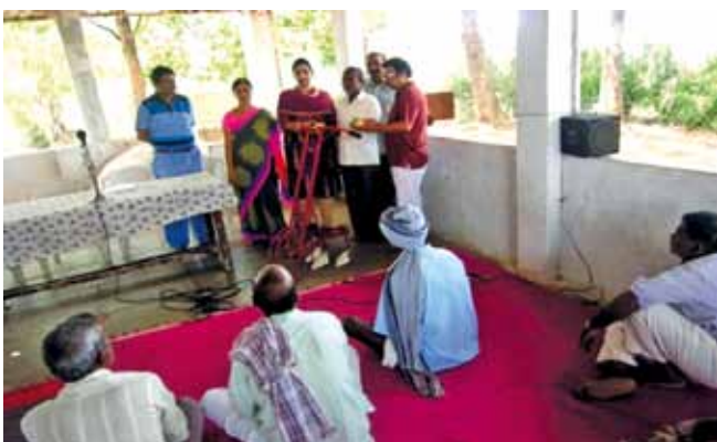
Distribution of Rotary weeders and shellers to farmers of Burjugadda Thanda, Ranga Reddy district, Telangana

The trainings on scientific cultivation of maize for enhanced profitability, hybrid maize seed production and agricultural skill development were organized at Regional Maize Research & Seed Production Centre, ICAR-IIMR, Begusarai for farmers of Bihar state.