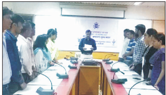
Integrity Pledge being taken by staff at ICAR-IIMR, Delhi Unit