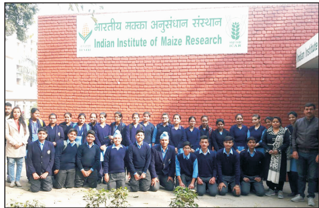
Students of BVM School visited ICAR-IIMR, Ludhiana to commemorate Agriculture Education Day

IIMR celebrated Agriculture Education Day on December 3, 2017 in the memory of birthday of 1 st Union Agriculture Minister and Bharat Ratna Dr. Rajender Prasad. Students from BVM Senior Secondary School, Ludhiana were invited to give them first-hand information related to agriculture sector and specially about maize research in India and around the world in order to develop their interest. They were taken to different laboratories for on-lab exposure and the maize documentary film highlighting the vision, mandate and the research work was played to give them an exposure of maize and agricultural research. They were also sensitized on 'Swacha Bharat Mission' of Government of India.