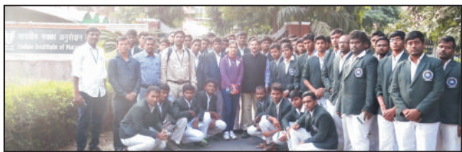
Students of RVMU Coimbatore visited ICAR-IIMR Delhi Unit

Also, a batch of 60 B.Sc. (Ag.) final year students from Ramakrishna Mission Vivekananda University (RMVU, Coimbatore, accompanied by 4 faculty members, visited ICAR-IIMR New Delhi Centre in the afternoon of November 30, 2017 as part of their All-India study tour.