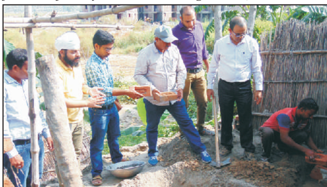
Construction of toilet at a disadvantaged area at Ladhawal by the staff of ICAR-IIMR, Ludhiana