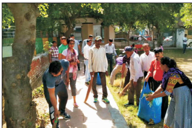
Cleaning of Children Park by ICAR-IIMR Delhi staff