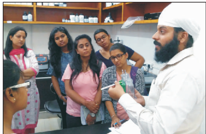
Students of Khalsa College for Women interacting with scientists of ICAR-IIMR, Ludhiana

Apart from this, students of B.Sc. Biotechnology of Khalsa College of Women visited IIMR on Sept. 1, 2017. The students interacted with scientists on various aspects of applied sciences. The students were also encouraged to participate in cleanliness drives at their level.