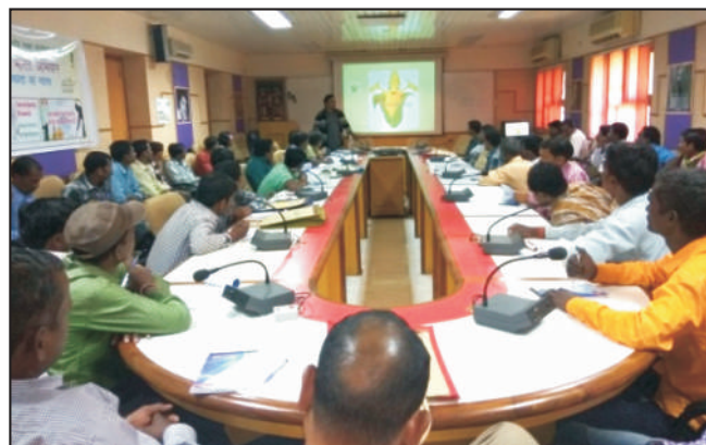
Special training for tribal farmers of Nabarangpur, Odisha

Under TSP programme training and demonstrations are being focused for technology dissemination along with critical input distribution among the tribal farmers. During January to March, 2017, 190 Hand Maize Sheller, 45 Battery Sprayers, 111 Sprayers, 1007 kg seeds, 46 baby corn cane, 50 QPM Kheer and 50 QPM Chips were distributed. Five training programmes were conducted by ICAR-IIMR at Delhi and Hyderabad where 218 farmers were benefitted. Similarly three training programmes were conducted at other stations benefitting 186 farmers. To enrich the knowledge literatures like मक्का, बेबीकॉर्न की खेती एवं उपयोग, कक्का का साइलेज पशुओं के लिये पोष्टिक आहार, खरीफ में मक्का की उन्नत खेती, Specialty Corn Cultivation in India and Rabi Maize were given to farmers. Apart from this critical inputs like Trench hoe (20), Battery operated sprayer (2), Manual maize sheller (35), Battery operated Knapsack sprayers (50), Sprayer Pumps (60), Taurpaulin (50), Sickle (50), Mumty (50) etc. were also given to tribal farmers.