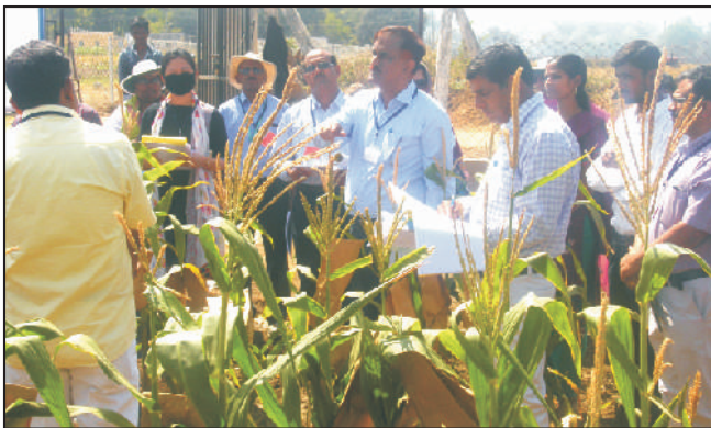
Maize Germplasm Field Day organized by ICAR-IIMR at WNC, Hyderabad

Indian Institute of Maize Research (IIMR) organized a Maize Germplasm Field Day at its 'Winter Nursery Centre' (WNC), Hyderabad on February 27, 2017. A total of 1401 maize accessions were grown in a compact block for assessment and selection by breeders, pathologists, agronomists and entomologists from 27 AICRP centres representing SAUs and ICAR institutes. The material included inbred lines from CIMMYT, NBPGR and large segregating materials with subtropical and temperate background from IIMR and seven AICRP centres. Thirty-eight participants from AICRP centres, SAUs and ICAR institutes participated in the field day. During the year, 546 accessions were distributed to 34 centres.