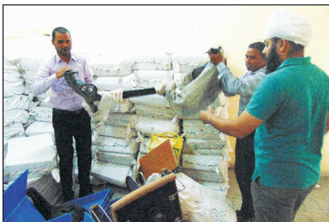
Cleaning of ICAR-IIMR Ludhiana store room by ICAR-IIMR staff