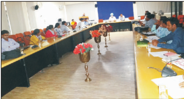
Institute Research Council (IRC) meeting held at ICAR-IIMR, Ludhiana

highlighted the importance of development of climate resilient hybrids to cope up with the changing global climate. This was followed by individual presentation of progress of 20 ongoing research projects during 2016-17. A total eleven new project proposals were discussed and approved.