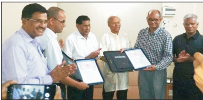
Memorandum of Understanding being expanded between ICAR-IIMR, Ludhiana and PJTSAU, Hyderabad

Memorandum of Understanding (MoU) between ICAR-Indian Institute of Maize Research, Ludhiana and Professor Jayashankar Telangana State Agricultural University, Hyderabad was signed by Director, ICAR-IIMR and Registrar, PJTSAU on August 21, 2017. The MoU was exchanged in the presence of IIMR QRT team and Vice-Chancellor of PJTSAU. As per the MoU, training of the students/ post graduate and Ph.D. research work is facilitated between these two institutions. Further, lease deed for providing land and other facilities for Winter Nursery Centre activities were also signed and exchanged between Registrar, PJTSAU and Director, ICAR-IIMR on the same day.