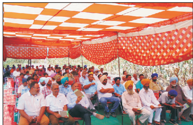
Participating farmers during 'Makka Kisaan Mela 2017'