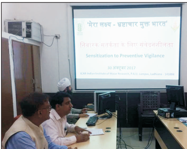
Discussion on Preventive Vigilance at ICAR-IIMR, Ludhiana

Vigilance week was observed in ICAR-IIMR and its regional stations from October 30 to November 4, 2017. Integrity Pledge was taken by every staff of the institute. A discussion on sensitization to preventive vigilance was held in IIMR, Ludhiana.