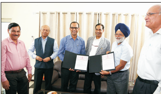
MoU exchanged between ICAR-IIMR and PAU on teaching and research

The Memorandum of Understanding (MoU) was signed between ICAR-Indian Institute of Maize Research, Ludhiana and Punjab Agricultural University, Ludhiana to promote collaboration in the field of research and teaching on October 16, 2017. The MoU recognized the scientific staff of IIMR, Ludhiana as a