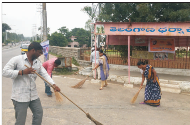
Cleaning of bus shelter (Rajendranagar) by Staff of ICAR-IIMR, WNC, Hyderabad