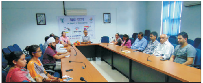
IIMR staff attending the 'Hindi Saptah' during the ceremony