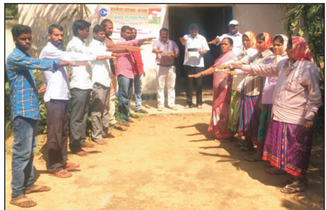
Integrity Pledge being taken by staff at ICAR-IIMR, WNC, Hyderabad