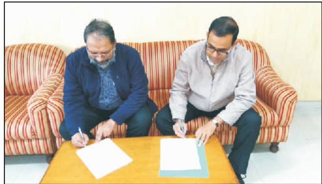
MoU signed between ICAR-IIMR and PAU on breeder seed production

faculty member of PAU, Ludhiana. According to the MoU instrument and library facilities of both the organizations will be shared between both the parties. Another MoU was also signed between ICAR-IIMR and PAU on November 20, 2017 regarding breeder seed production of wheat.