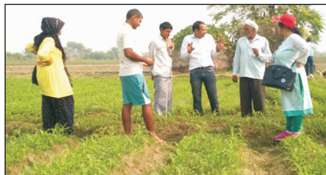
Interaction of scientists of ICAR-IIMR with farmers under 'Mera Gaon Mera Gaurav' Programme at Jhundpur, Sonipat, Haryana

The IIMR is implementing the 'Mera Gaon Mera Gaurav' programme by regular visit and interaction of the scientists with the farmers in the states of Telengana, Bihar, Haryana and the Punjab. The major activities undertook during July to December 2017 were visit to adopted villages, literature distribution, farmer scientist interaction meetings and demonstration of the improved technologies in the farmers field.