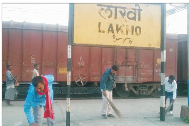
Cleaning of Lakho railway station by Staff of ICAR-IIMR, RMR&SPC, Begusarai